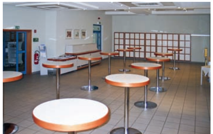
The assembly hall directly adjacent to the seminar rooms offers various and flexible options for accompanying exhibitions.